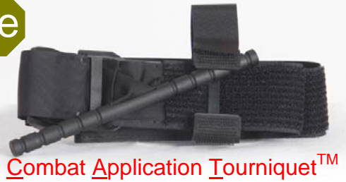
Combat Application Tourniquet™